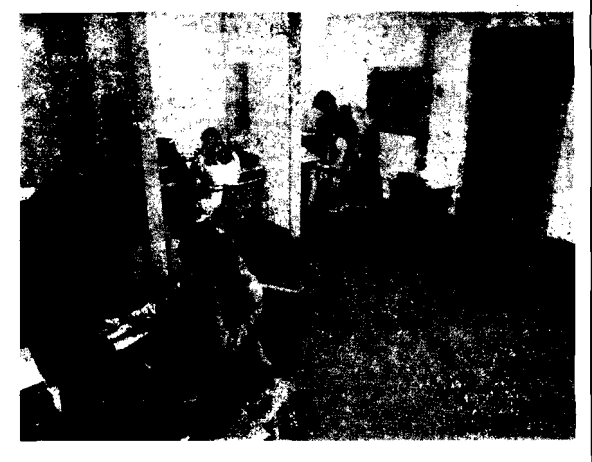
Recently completed renovetions to the former garage of the WEBR/WNED-FM studios at 23 North Street have provided some much needed additional office space for WEBR Newsradio, the nation's only community supported all-news operation. The news room has been expanded by relocating a production studio, and three additional editing/dubbing stations (shown above) have been additing/dubbing stations (shown above) have been additing/dubbing stations (shown above) have been additing.

REFERENCE LIBRARY: A reference library exists for members. Members should have received a library list of materials with their membership. Only two items can be borrowed at one time, for a one Please use the month period. proper designations for materials to be borrowed. When ordering books include $1.00 to cover rental, postage, and packaging. Please include $ .50 for other items. If you wish to contribute to the library the OTRC will copy If you wish to contribute materials and return theoriginals to you. See address on page 2.